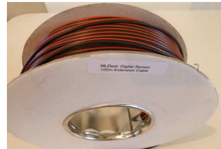
100m digital extension cable