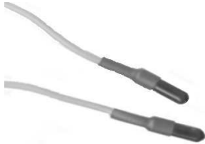
Air temperature sensor cable (20m as standard), MLS20